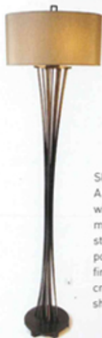
SKYLIGHT A freestanding lamp with random gathered-metal rods on a round, steel base with a polished-gunmetal finish and an elliptical, cream pongee-silk shade.