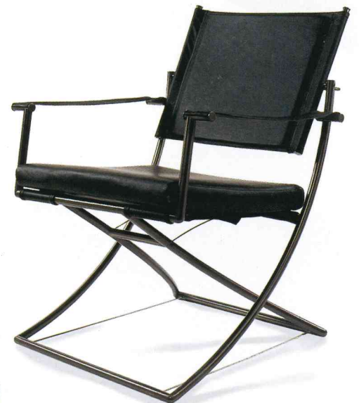
The Wellington chair, above, and the Note to Self desk, above left