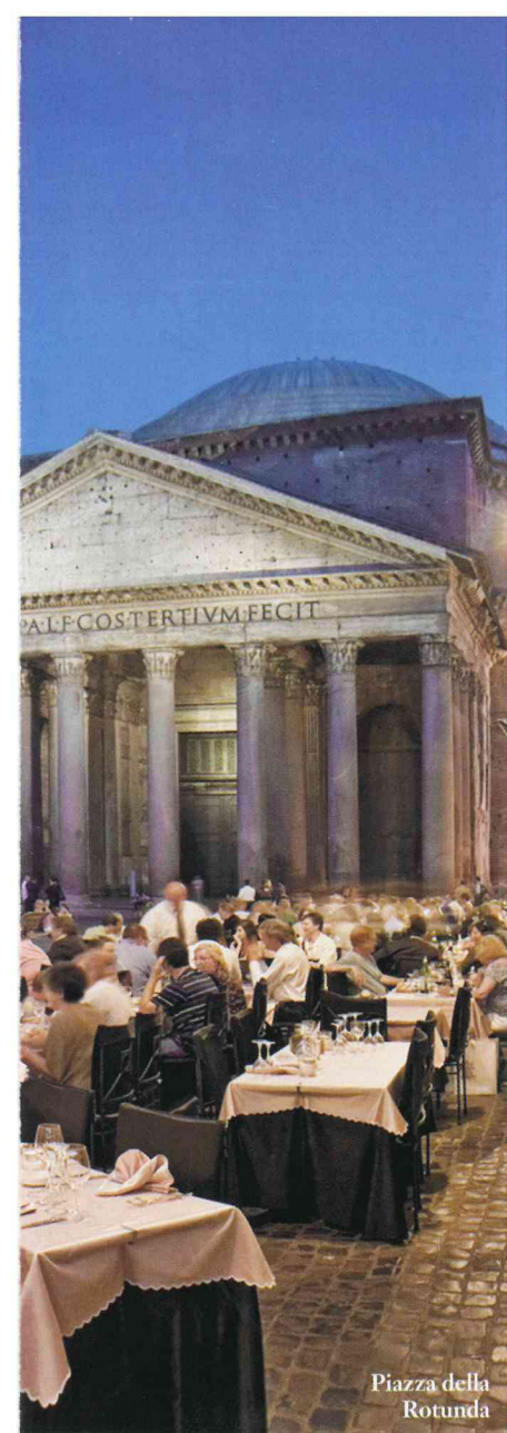
Piazza della Rotunda